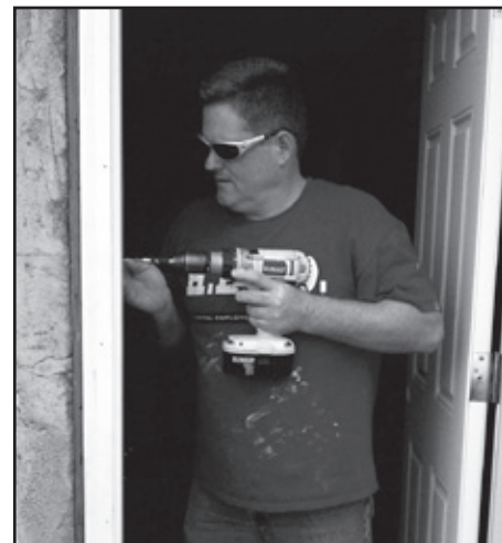
▶ Several new doors installed during Christmas in October will help Rosedale residents keep the cold out this winter.

O n October 1, RDA partnered with KU Med and Hospital to host the 16th year of Christmas in October in Rosedale. The program assists elderly or disabled low-income families with repair and upkeep projects each year.