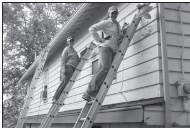
▲ KU Med and Hospital volunteers painting the exterior of one of twelve houses repaired and improved this year.