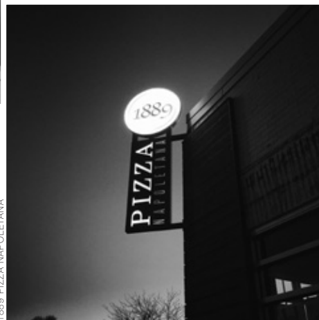
1889 PIZZA NAPOLETANA