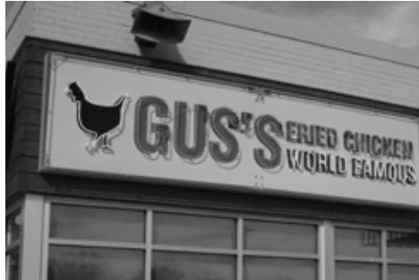
Rosedale welcomes spicy southern fried chicken to the neighborhood.

"We're excited to open and see what the community makes of it," Kelli added.