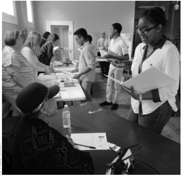
JE T'AIME TAYLOR