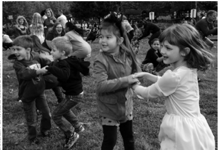
UNIVERSITY OF KANSAS MEDICAL CENTER

Join RDA at Healthy Halloween from 2-5 p.m. on October 22 at Whitmore Playground.