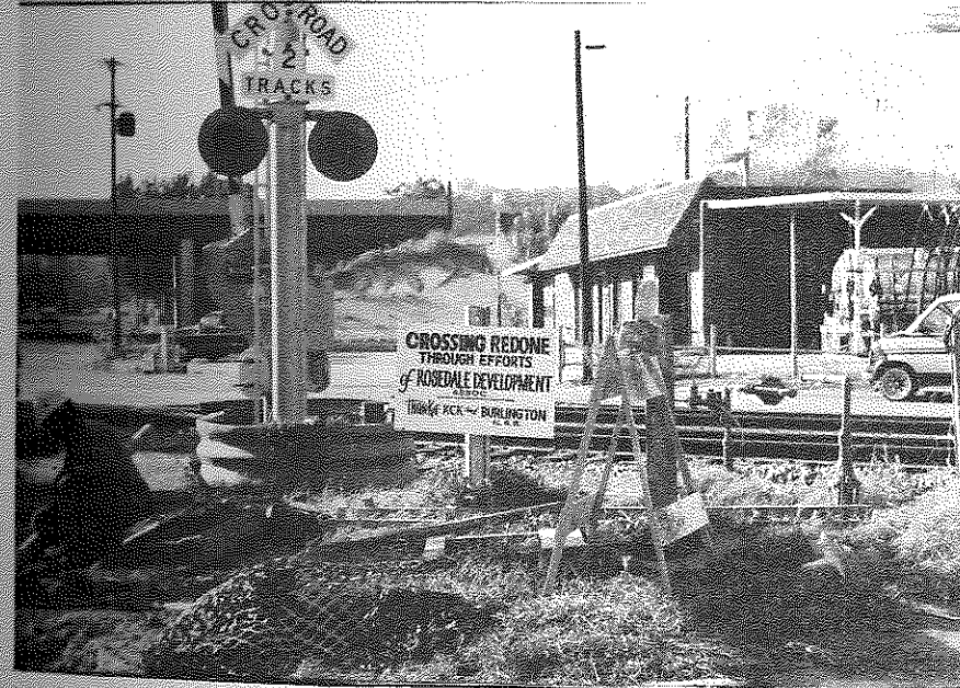
Railroad crossing at Southwest Blvd. and Henning Street.

Copies donated by Kinko's 39th & Rainbow