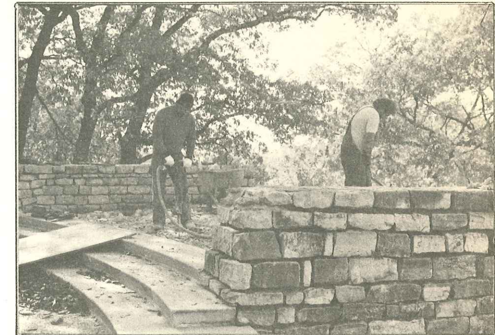
WORKERS FROM JOHN ROHRER CONTRACTING CO., INC., AT THE ROSEDALE ARCH OCTOBER 26, 1990