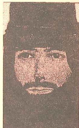
A composite of the suspect.

Johnson County Sheriff's Office (913) 761-5560 Westwood Police Department (913) 362-3737 Tips Hotline (816) 474-TIPS (8477)