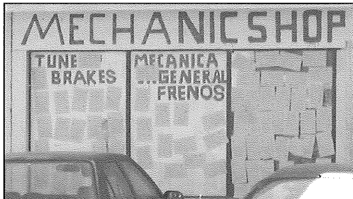
Police citations cover the front of a Merriam Ln. Mechanic Shop.

The Mechanic Shop on Merriam Lane has long been an eyesore. It has effected the surrounding businesses and has been a safety hazard for drivers. Cars were packed into the space in front of the shop, and at times spilled out into the road. Large numbers of junk cars were housed behind the building. Working on the cars outside and storage of junk vehicles were a violation of the C3 zoning. RDA had been working with officials since February to have something done about these violations. On October 28 local police officers and state officials wrote citations for all the vehicles housed at The Mechanic Shop. A total of 113 cars were found. A few cars were found with incorrect tags. The owners had forty-five days to remove the cars or they would be crushed by the state at the owner's cost. So far they are complying by removing the cars.