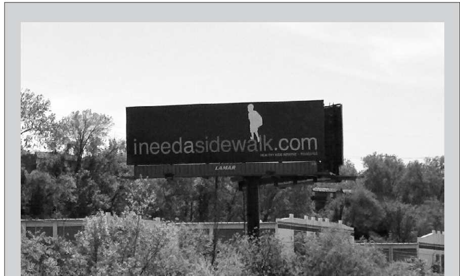
The I Need a Sidewalk campaign billboard went up on I-35 South, near Lamar. The campaign targets the lack of sidewalks on Mission Road, and especially the need for a crosswalk into Rosedale Park. Check out ineedasidewalk.com to see other areas in need of sidewalks or to upload a photo and share your own story of missing sidewalks.