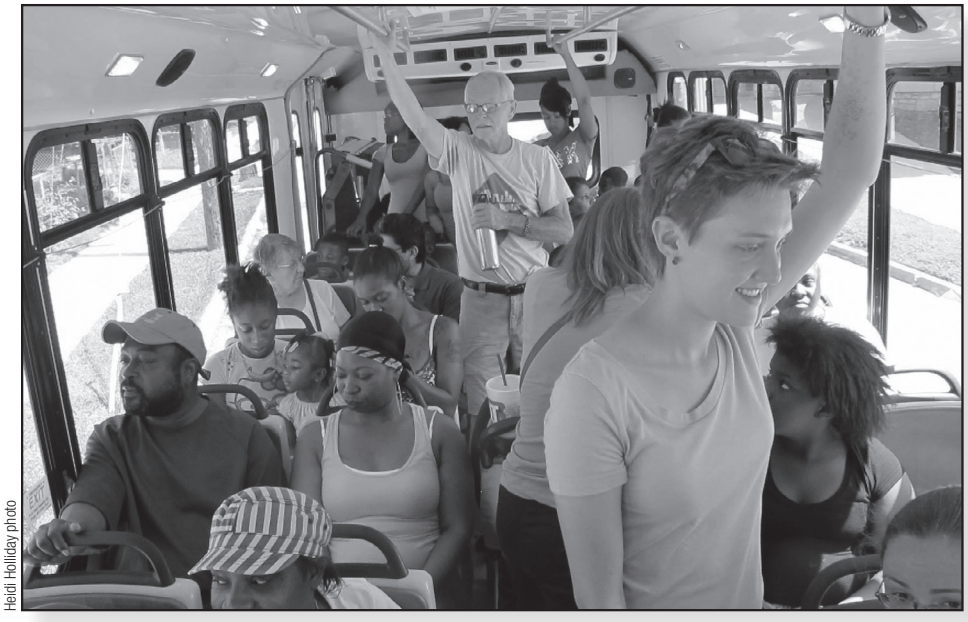
40 excited Rosedalians boarded Rosedale's first bus to ride from Southwest Boulevard to the Kick-Off Celebration at Emerson Park.

UG Transit hosted a kickoff event for the bus line on June 30th at Emerson