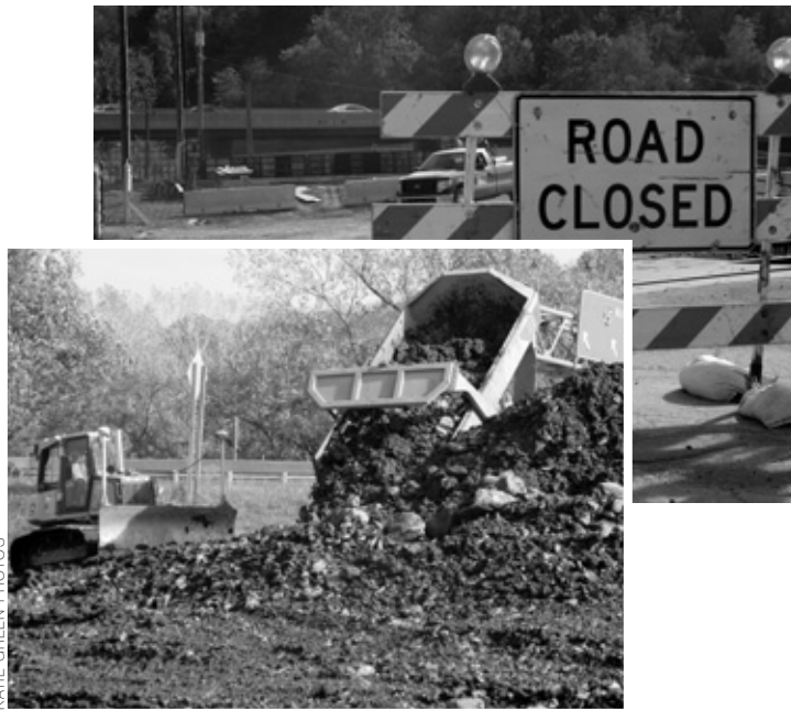
The Army Corps of Engineers is finishing the flood control improvements S. Mill St.