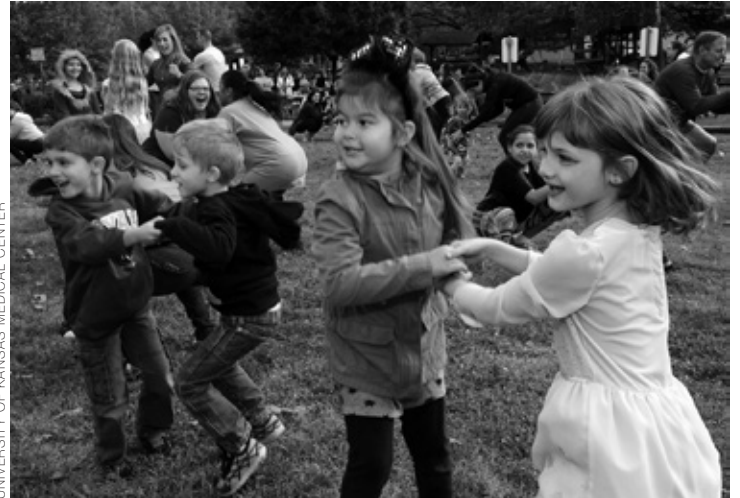
UNIVERSITY OF KANSAS MEDICAL CENTER

Join RDA at Healthy Halloween from 2-5 p.m. on October 22 at Whitmore Playground.