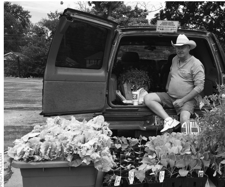
Grow your own food or work with a community organization offering services in Rosedale? Join the Rosedale Farmers Market this summer as a vendor or with a community resource table.