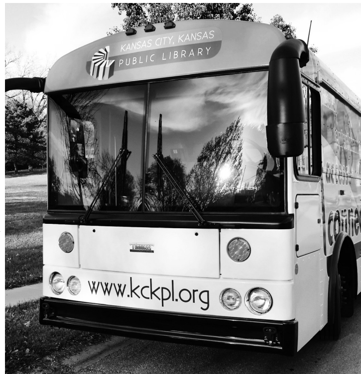
Check out a book while RDA's AmeriCorps team works on your bike this spring!

i For more information about the Kansas City Kansas Public Library Mobile Library, please visit kckpl.org .