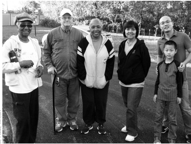
Rosedale residents explore the neighborhood around Fisher Park each week with the walking club.