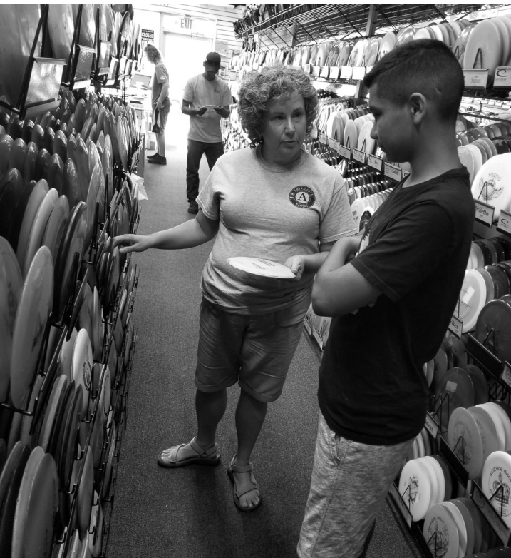
JE T'AIME TAYLOR