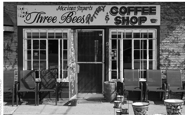
Three Bee's Pottery and Coffee Shop is open 7 a.m.-7 p.m. Monday through Saturday at 925 Southwest Blvd.