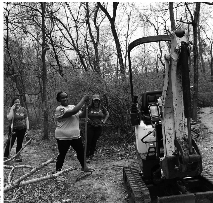
Tired trail workers rest after re-routing trail in Fisher Park

OR contribute online at rosedale.org/archclub .