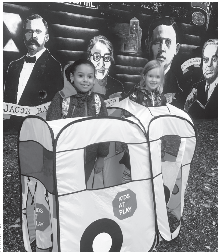
Volunteers and muralists join Frank Rushton staff and scholars for International Walk to School Day.