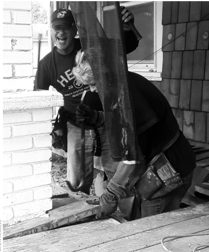
Volunteers repair a Rosedalian's porch with Christmas in October.

All Rosedalian deserve housing that is safe, warm, and in good condition. Volunteers and partners like TUKHS and CIO improve quality of life for Rosedale seniors and people with disabilities, and each home they fix up helps improve the beauty, safety, and walkability of our neighborhoods as a whole. Thank you to the University