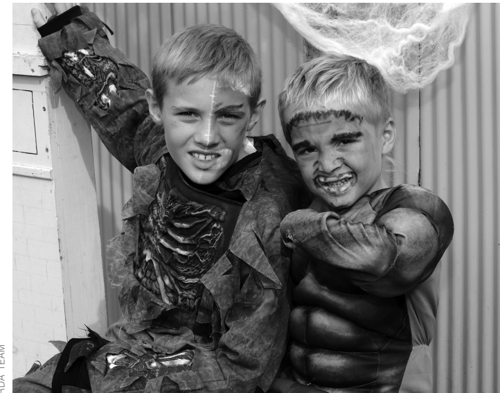
Costumes are encouraged but not required at Healthy Halloween at KUMC on Saturday, October 27.