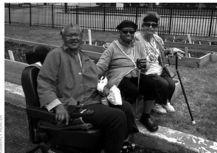
Garden angels at Rosedale Towers tend their cooperatively grown plots from spring through autumn.

📞 To share a memory, contact Kimberly at 913-677-5097 or kimberly@rosedale.org .