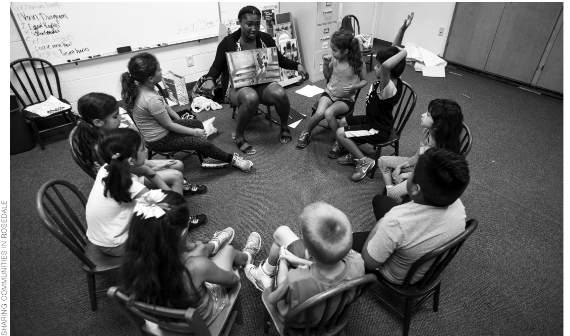
SHARING COMMUNITIES IN ROSEDALE

To enroll a child in the program, attend Enrollment Night, May 7, at Rainbow Mennonite Church. Returning families should arrive at 6 p.m. and new families at 6:30 p.m. Bring a cash or check payment for the registration fee ($35 for one child or $70 for two or more children in the same household) and the activity fee ($150 for one child or $300 for two or more children in the same household), and