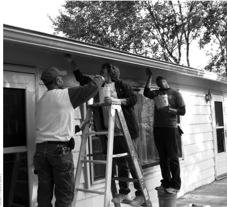
Each October, volunteers help repair neighbors' homes.

Last year, 317 dedicated individuals repaired 20 homes in Rosedale over two high-energy weekends. They built wheelchair ramps, cut back vegetation, scraped and painted, fixed leaky plumbing, repaired roofs, replaced broken windows, built fences, patched up steps and driveways, and got to know their neighbors. Volunteers and partners like TUKHS and CIO improve quality of life for Rosedale seniors and people with disabilities, and each home they fix up helps improve the beauty, safety, and walk-