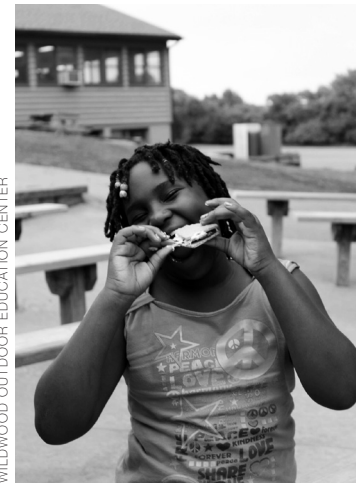
Rosedale youth enjoy s'mores around the campfire during their 2018 camp week.

📍 To learn more, contact Alissa Workman at 913-677-5097 or alissa@rosedale.org .