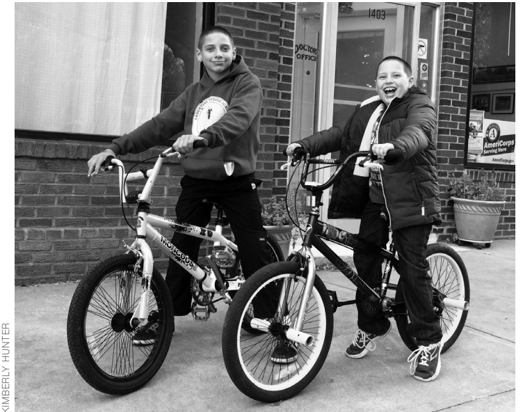
Two Rosedale brothers rejoice to have their bikes repaired.

Rosedale Development Association, 1403 Southwest Blvd., Kansas City, KS 66103 OR contribute online at rosedale.org/archclub .