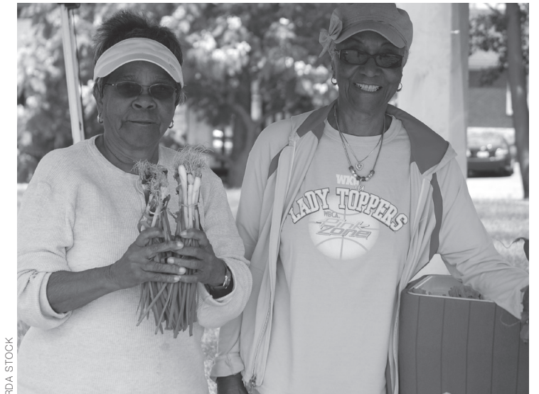
Senior shoppers may double their dollars at the Rosedale Farmers Market.