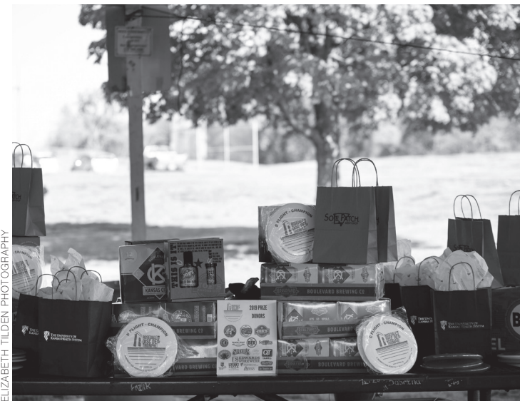
Many Rosedale and KC-area businesses donated prizes, discs, bags, and lots of additional goodies for all who competed in the third annual Rosedale Disc de Triomphe.