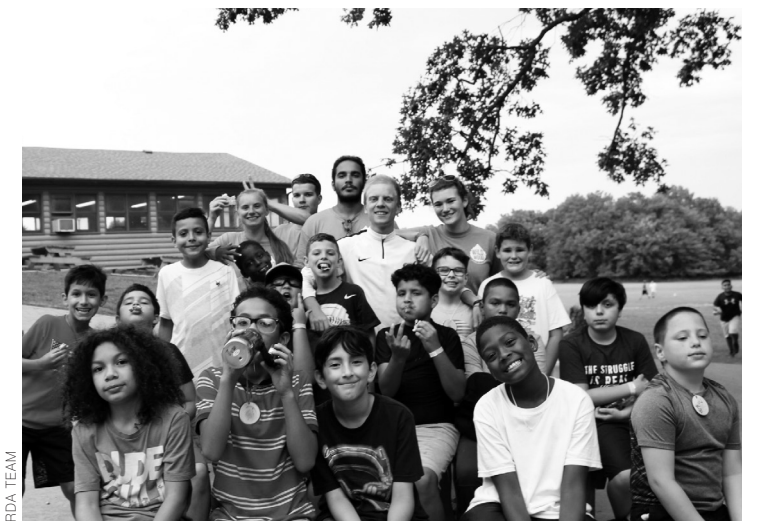
Rosedale youth enjoy their week at Wildwood!