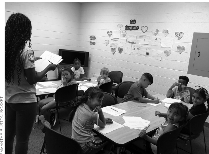
A Classroom Facilitator leads the scholars in the daily curriculum.