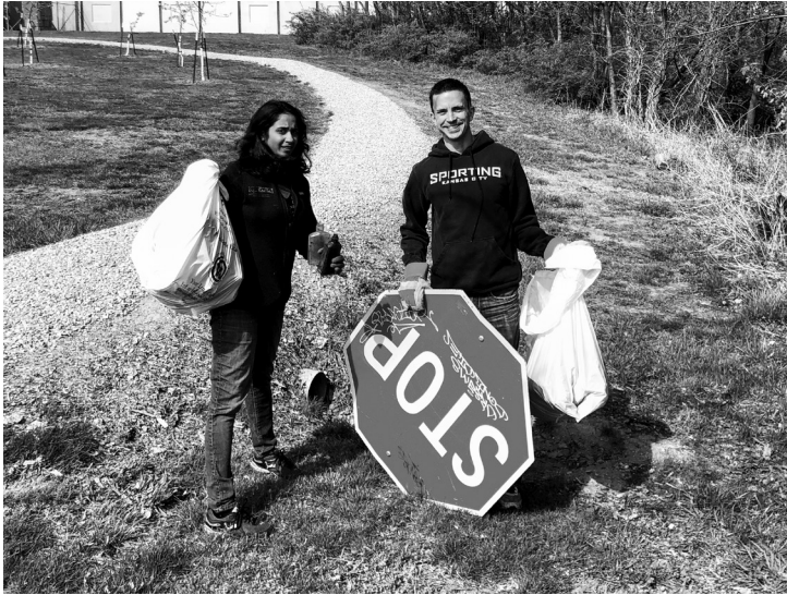
KU ENT team removes a discarded stop sign from a tree grove.

We are also asking the community to submit any eye-sores they may notice between now and April 3. These can include graffiti, trash on the side of intersections, and any other bothersome debris. If you are not available on All Rosedale Cleanup day, there are many other opportunities for beautification. Starting in March, RDA will be cleaning and maintaining the 4.5 mile Rozarks