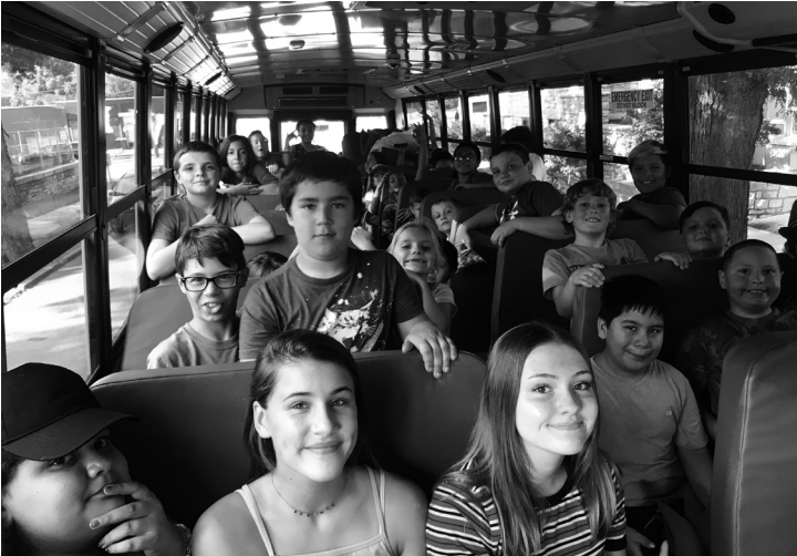
Rosedale's 2019 campers eagerly wait to ride the bus for a week of fun at Wildwood. While some are nervous for their first sleep-away experience, others barely look back to wave goodbye to parents.