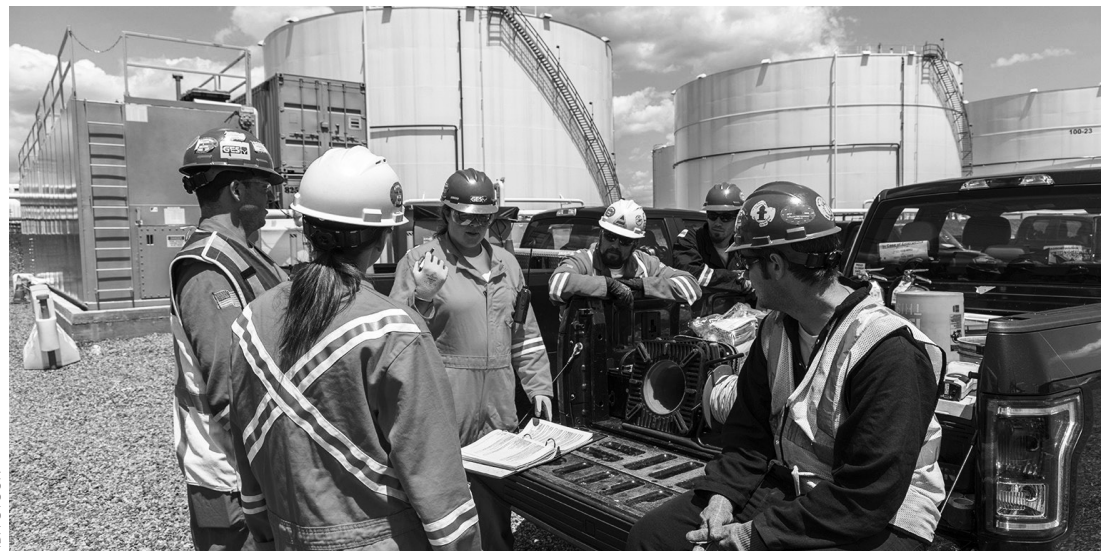
Environmental workers are learning on the job.

For more information and to get started on your new career path, contact Sasheen Cutchlow at 913-677-0100 ext. 250 or scutchlow@elcentroinc.com