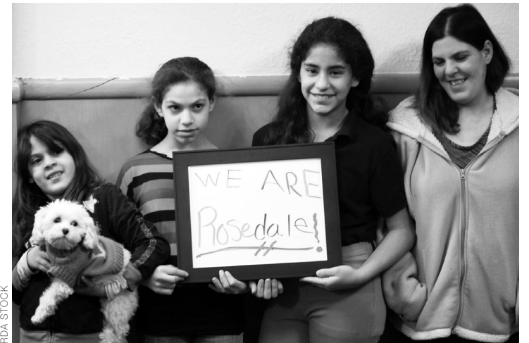
Rosedalians pose for RDA's “We are Rosedale” campaign.

Please help make sure Rosedale is fully represented by making sure everyone in your household, no matter their age, is counted, and make sure your neighbors do the same.