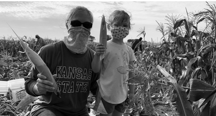
Volunteers glean corn for After the Harvest to distribute.