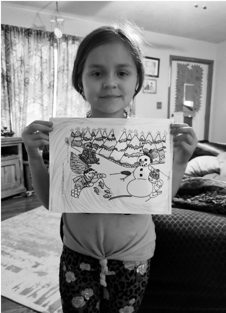
Drawing supplies are one of the many learning tools inside ARCH activity boxes.

🏠 RDA has one more office space for rent. Please contact info@rosedale.org or call 913-677-5097 for details.