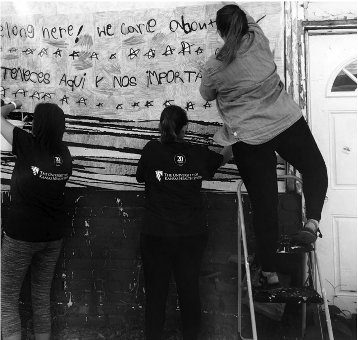
Volunteers paint a mural in hopes of preventing violence by showing a strong community presence.

For more information on how RDA supports businesses, visit rosedale.org/businesses .