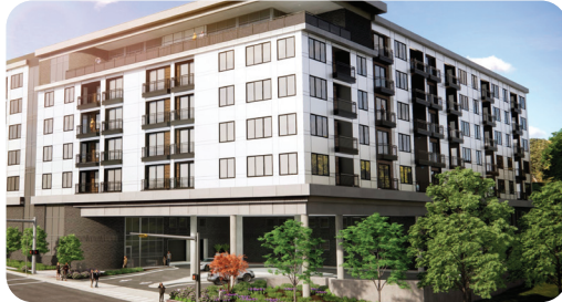
The Hudson's completion date will be in summer of 2025.

with construction beginning on the Hudson apartments, the completion of the 47th St. Complete Streets Project, and a new Rainbow Boulevard Traffic Plan (currently in progress) working to improve the safety and usability of Rainbow.