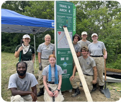
Honeysuckle met its match thanks to the AmeriCorps NCCC team.