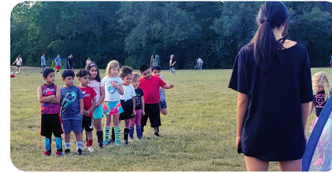
A soccer team readies itself for a new match.