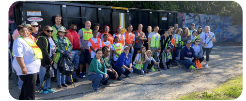
Neighbors do the work of keeping Rosedale beautiful.

continued to show up for community cleanups, advocating toward ordinances that preserve the supply of safe and affordable housing in KCK, and keeping our community connected and informed.