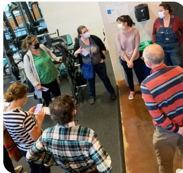
Stakeholders reviewed a recreation center for ideas.

did tremendous work on engaging the community and drilling down on exactly what kind of community center Rosedaleans want and need, our pace slowed in 2023 while we worked with partners and potential partners to figure out the nuts and bolts of funding and building what we've planned. It's hard to pause/wait and make sure we have a workable plan when all we want is to move forward, but we're committed to doing everything it takes to make sure Rosedale gets a community center that can thrive here long-term.